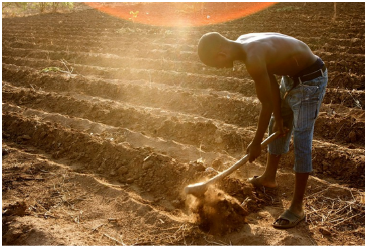
"A farmer prepares his field for the planting season near Nthenje on the outskirts of Lilongwe, Malawi. Australia is using its expertise and experience to help improve food security in African countries."