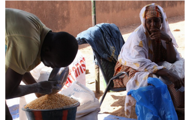
"Patiently Waiting for Food Aid in Bamako Mali" by DFID – UK Department for International Development. CC BY 2.0, accessed via Wikimedia Commons

There was a time when a respected essayist could less egregiously pontificate that we will do nothing to lift ourselves from unhappy passivity about world hunger, for there was no feasible solution in sight. But that time has passed, rendered archaic by the IFST, the offspring of a marriage of practicality and vision which cuts no slack for the perverse comfort of pessimism. The recent Internet release of the mythic animated short film Thunder Head Clearing will, over time, spread awareness of the Treaty's power to catalyze hunger eradication so far as to embarrass anyone who would contemplate coating an unfounded generalization that we're all AADS victims with the lacquer of expert opinion.